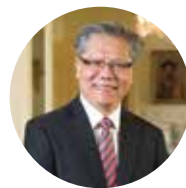
The Hon Hieu Van Le AC Adelaide Festival Centre Trust Chair

Thank you for being an integral part of our journey.