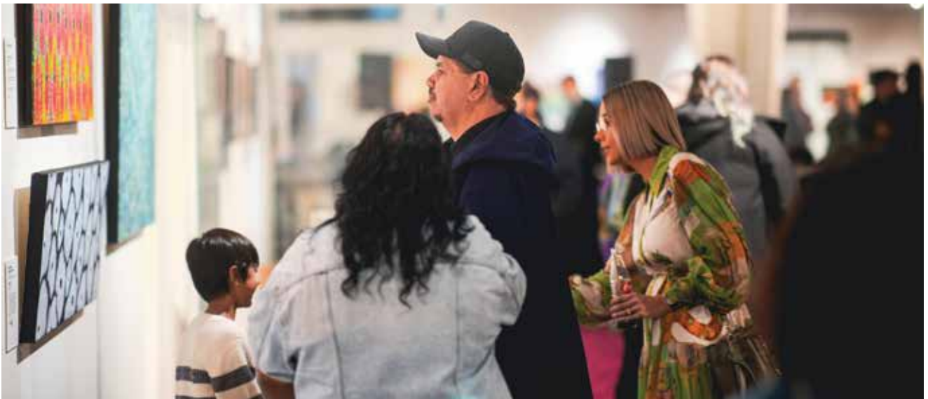
OUR MOB Exhibition Opening

Please see page 43 for further information about the Trevor Nickolls Art Prize winners.