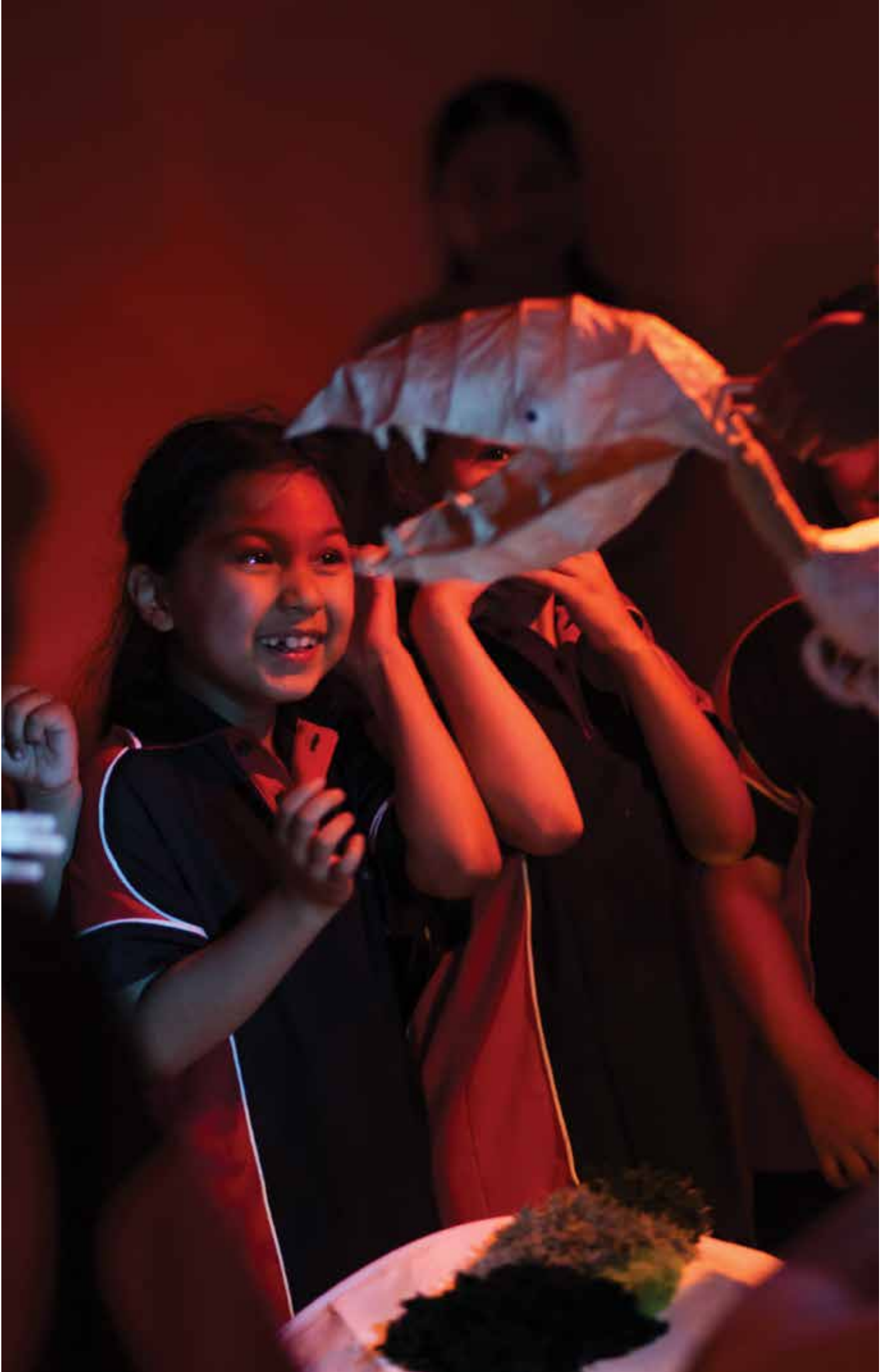
The Little Nests at OzAsia Festival