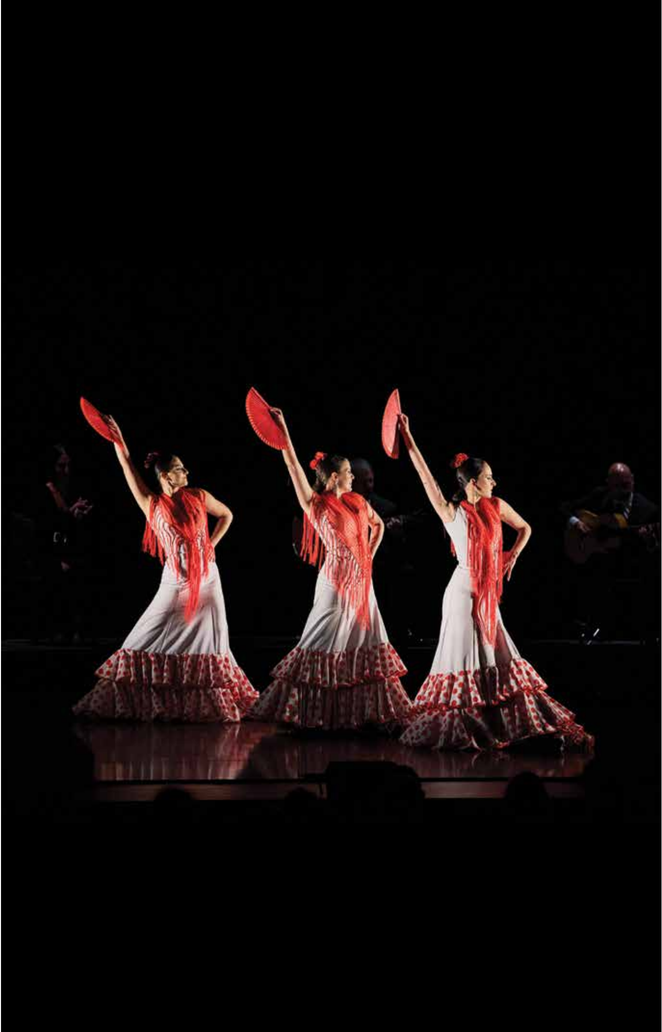
Colours of Spain at Her Majesty's Theatre