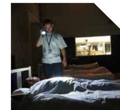
theatre THE ANGEL PROJECT

There was a rabbit plague, and there were immigrants. There was a Metaphor. And the Metaphor was going to be the play. And then it didn't work. And there was the beginning of a very personal account of what it's like to be new here. This is a development of that personal account.